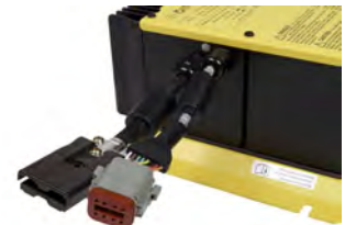
Rear view of QuiQ ICON configuration shows inline DC and signal connectors (charger output on left, signal I/O on right). Mate with OEM specific output cords.

QuiQ and the Power in Motion slogan are trademarks of Delta-Q Technologies Corp. Copyright © 2006 Delta-Q Technologies Corp.