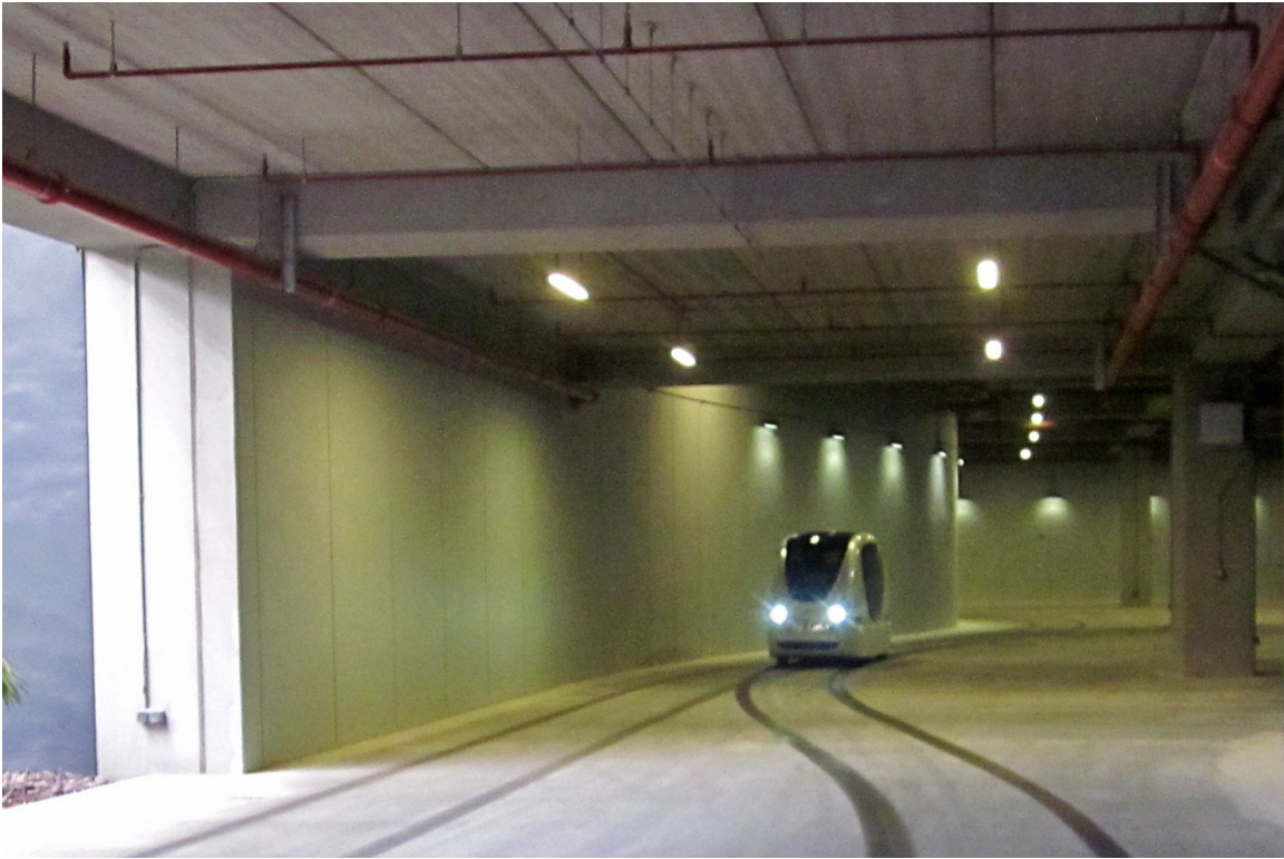
A PRT vehicle in Masdar City, a planned city in Abu Dhabi, in the United Arab Emirates

While there are a small number of PRT systems [11] that have been implemented, none can be called 'high capacity' and it is doubtful if any of the implemented designs would be suitable for taking the majority of a large city's traffic as this HCORT system is designed for.