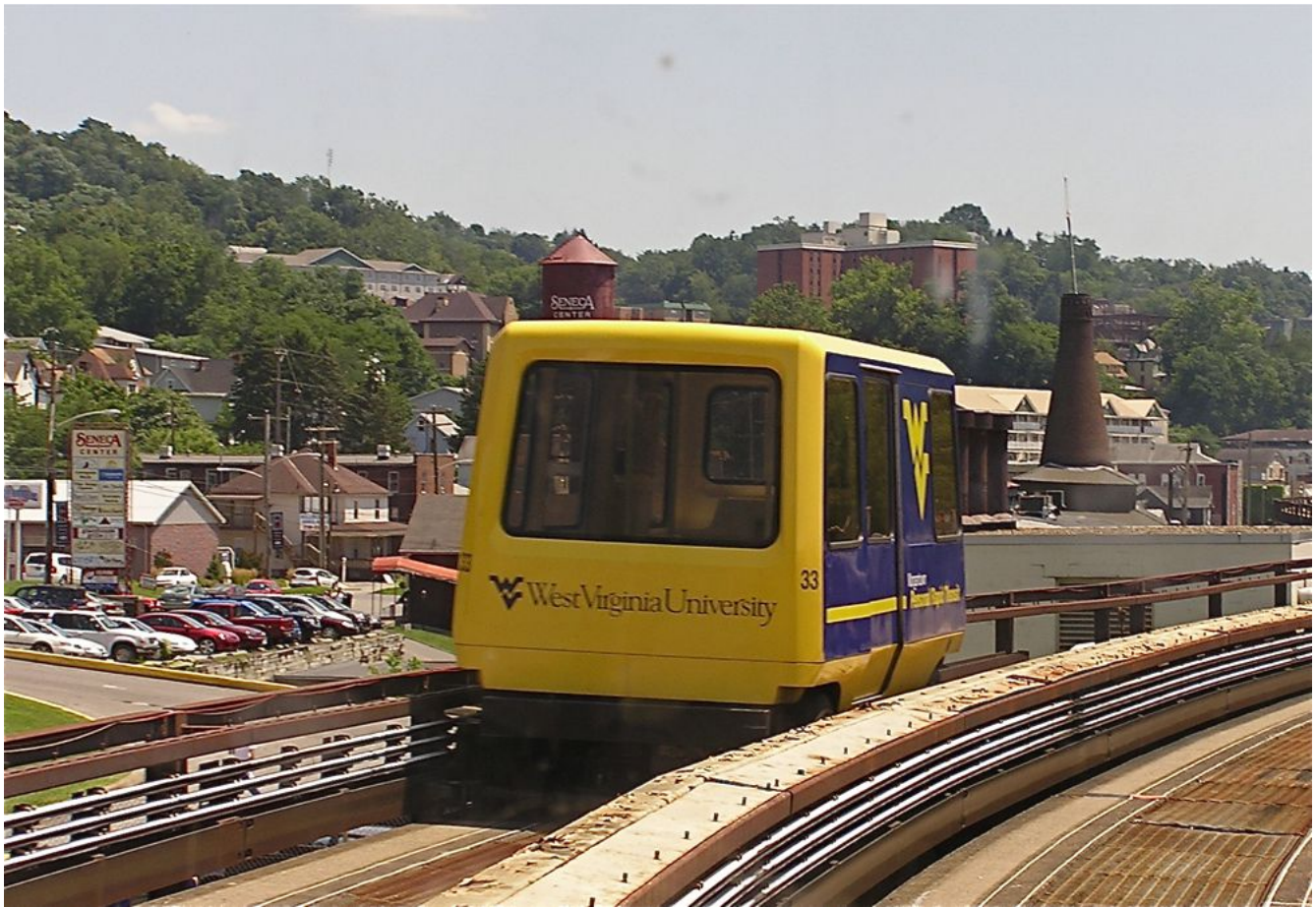
Morgantown PRT vehicle on guideway

It should also be pointed out that taking extreme views on each concept does not necessarily produce the most optimal result. For example, always sticking to the PRT requirement that 'all trips should be just direct origin-to-destination with no need to stop at intermediate points'. Breaking this rule, along with breaking the 'for exclusive use of an individual or small group traveling together by choice' rule can be used to increase efficiency.